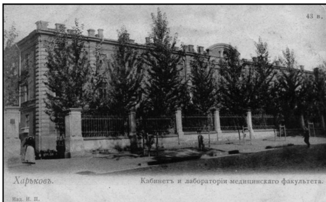
Figure 2 University of Kharkov Medical Faculty building (c. 1910)

muscles. 3 This was followed by On the origin of red blood corpuscles in mammals . 3 In 1882 he was awarded an MD for his thesis on the structure and function of tactile corpuscles in the papillae of the beak and tongue of birds, On the structure of corpuscles of Grandry . 4 Thereafter he joined the staff of Kharkov University where he remained for 27 years earning a substantial reputation as